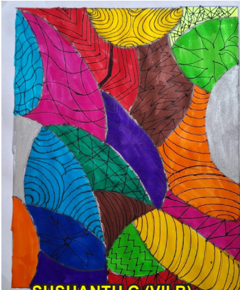
SUSHANTH G (VII B)