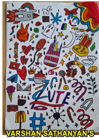
VARSHAN SATHANYAN S (VII B)