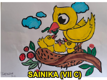
SAINIKA (VII C)